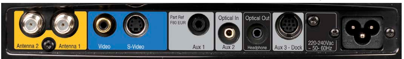
The comprehensive rear panel includes dual assignable external antenna sockets, video outputs, headphone and optical out and three auxiliary inputs.